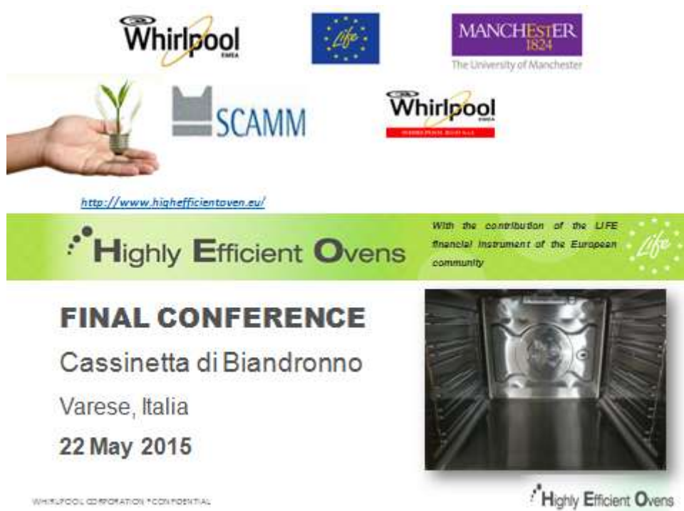
Figure 1 HEO Final Conference

During the conference, for both projects a poster has been exposed and leaflets and brochures distributed.