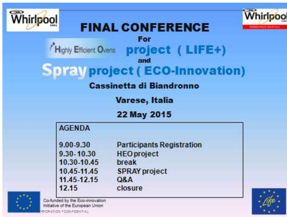
Figure 2 HEO Final conference

In particular, the agenda was as follows: